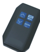
IR programmer PMT-15