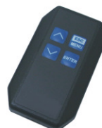
IR programmer PMT-15