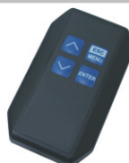
IR programmer PMT-15